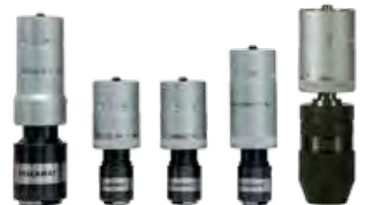
*Module required for tapping. Arm & module sold separately.